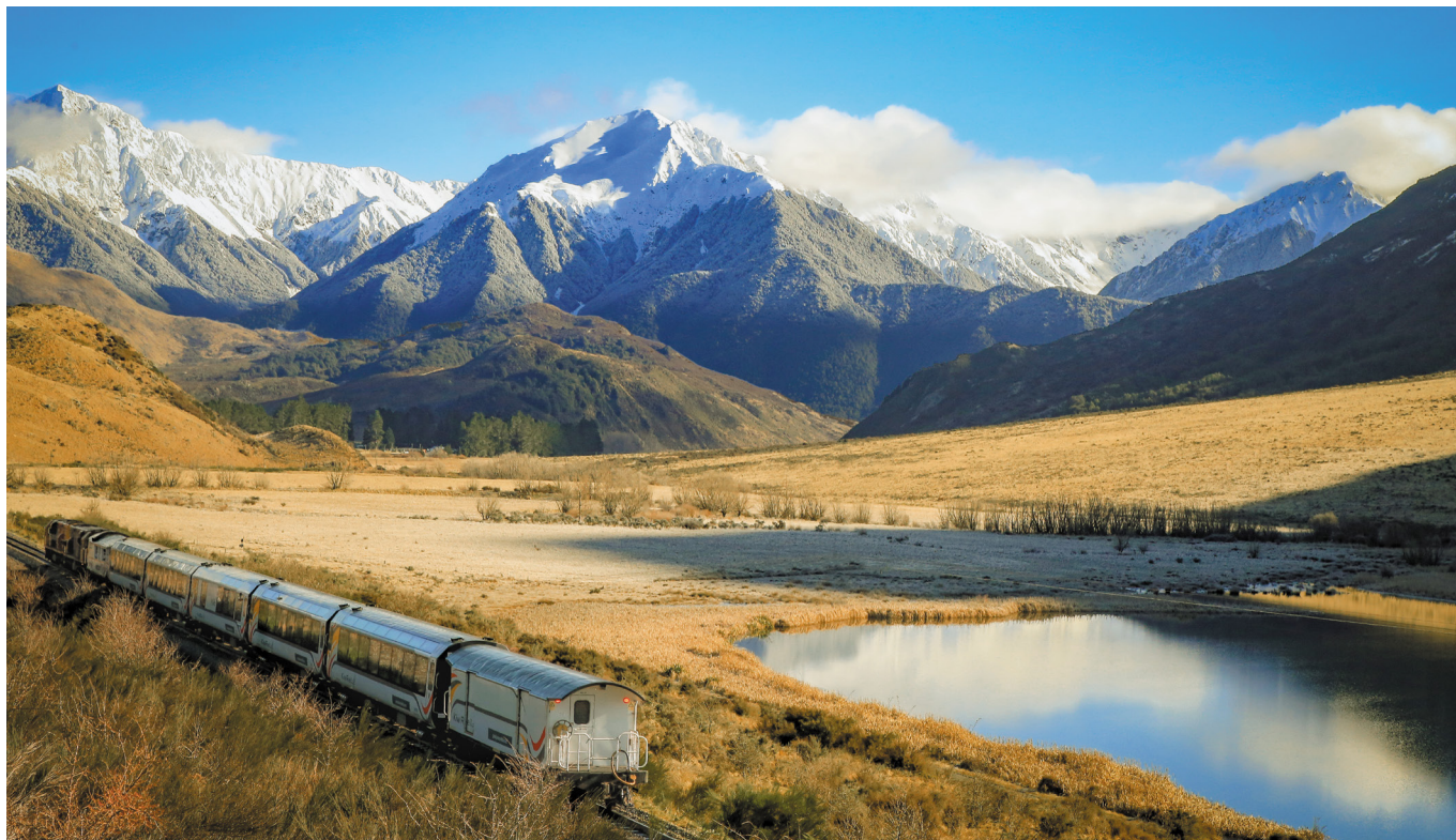
The TransAlpine, renowned as one of the great train journeys of the world.