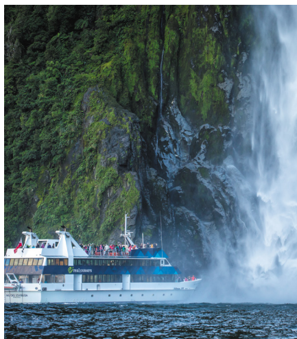
Tour Highlight: The Milford Sound Cruise and Lunch.