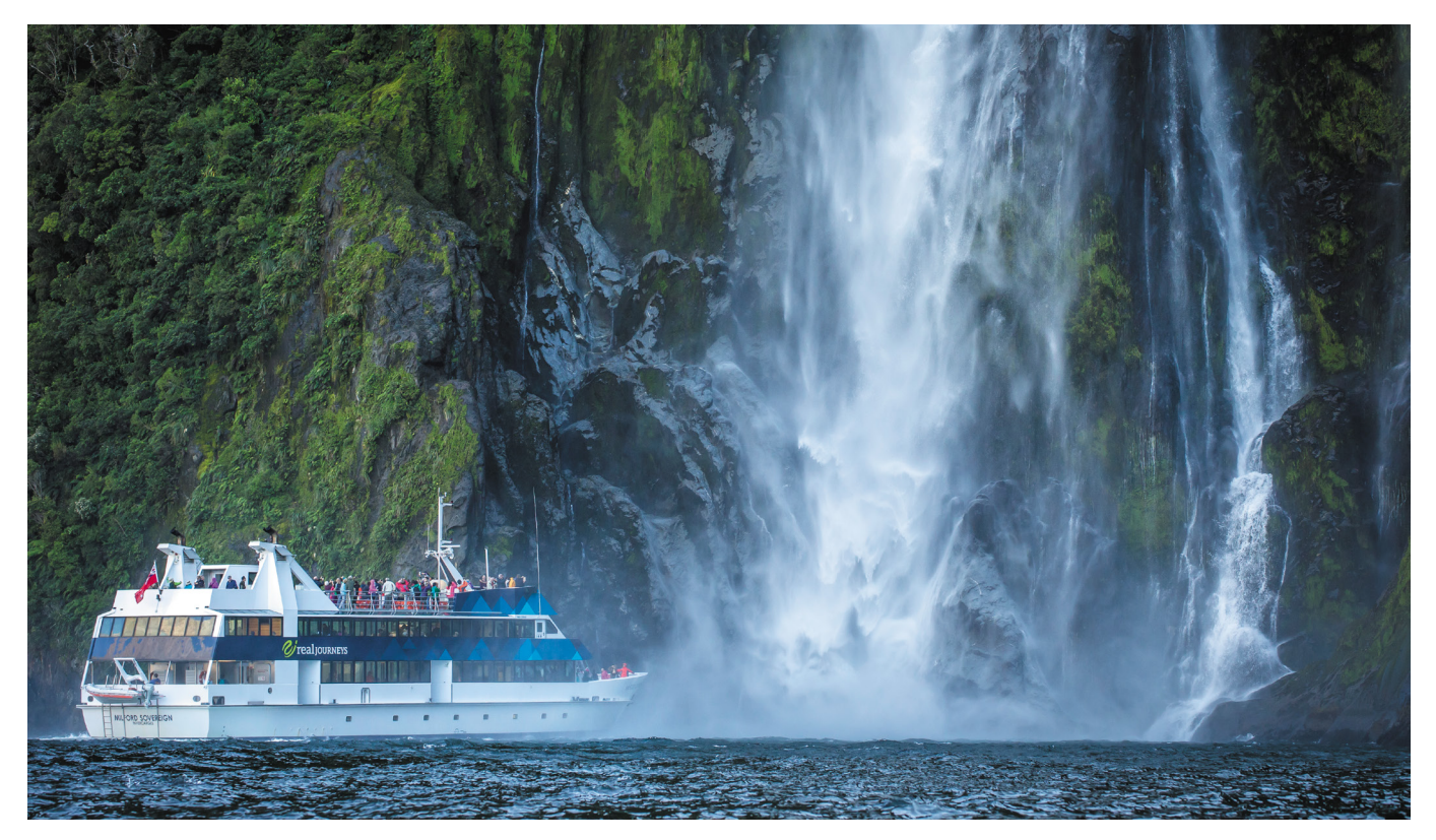
Board your launch for a cruise on the magnificent Milford Sound. See the spectacular Bowen Falls and towering Mitre Peak as you enjoy lunch onboard.