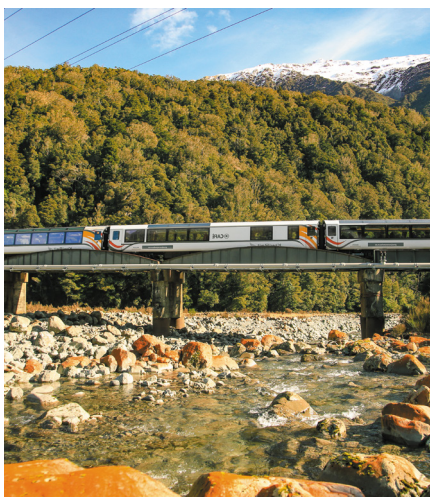
Tour Highlight: The TranzAlpine Rail Journey.