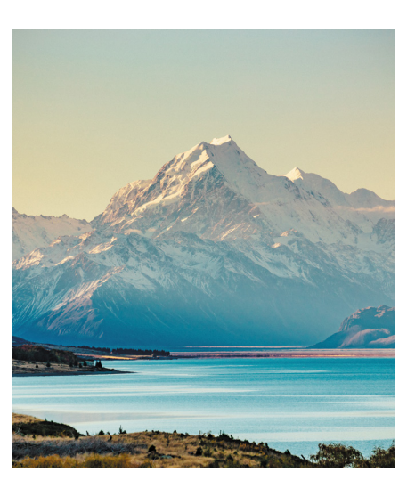
Marvel at spectacular Mt Cook, NZ's highest peak.

Visit the South Island in ultimate style with like-minded travellers