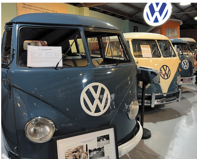
Explore vintage vehicles and transport history at Bill Richardson Transport World.

SPEND 3 NIGHTS IN QUEENSTOWN Experience the breathtaking beauty of Queenstown with an unforgettable three-night stay. Nestled on the pristine shores of Lake Wakatipu, this alpine paradise offers breathtaking scenery, thrilling outdoor activities, and vibrant nightlife. Discover the region's renowned vineyards, historic mining towns and picturesque streets. Savour gourmet dining and unwind in luxurious accommodations while surrounded by majestic mountains.