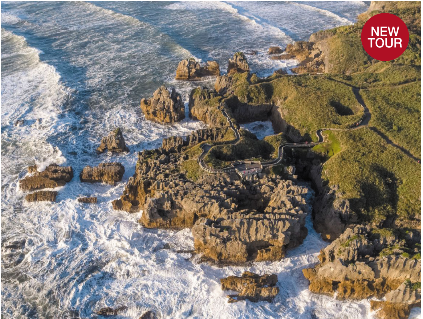
Aerial overview of the unique set up of walkways and viewing platforms of the world-famous Punakaiki Pancake Rocks and Blowholes.