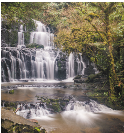
Visit the triple-tiered cascading waterfall at Purakaunui, part of the remarkable region of The Catlins.