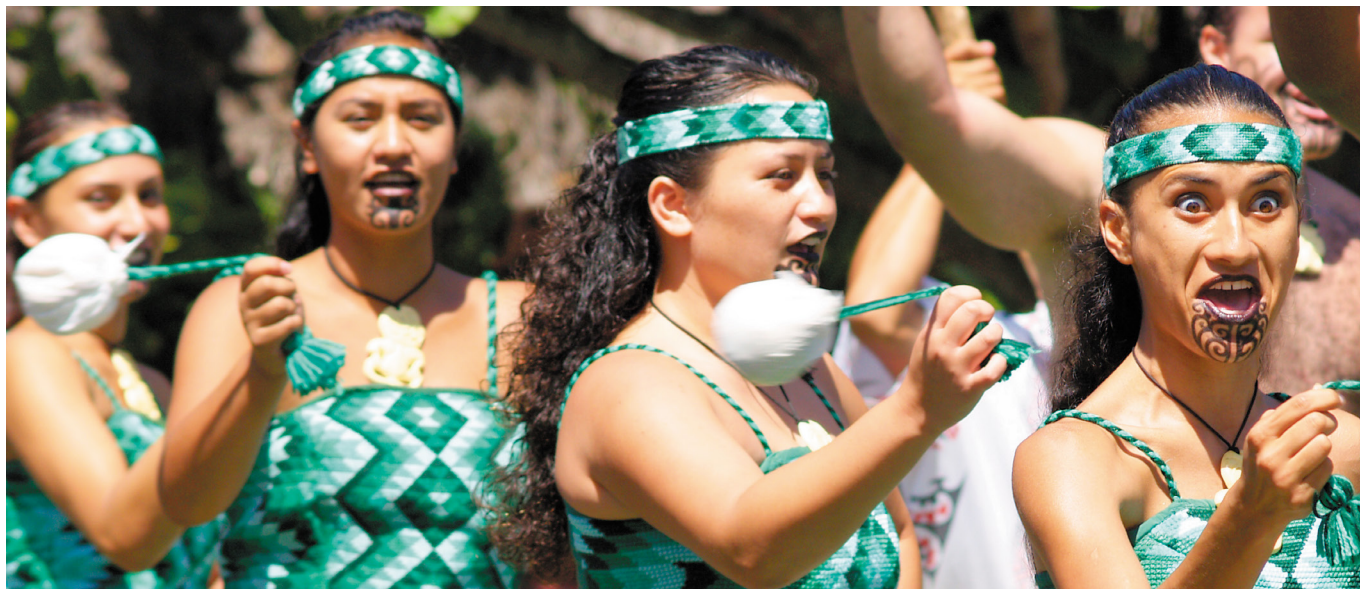
In Rotorua enjoy a Māori cultural performance which features the graceful poi dance.