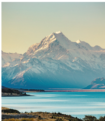
Marvel at spectacular Mt Cook, NZ's highest peak.