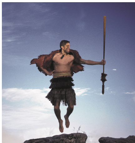
Feel the spirit of the Māori culture and traditions.

Fully escorted tour includes transfers in New Zealand, Premium Economy 32 seat coach travel, 4 star accommodation, most meals, sightseeing and attractions.