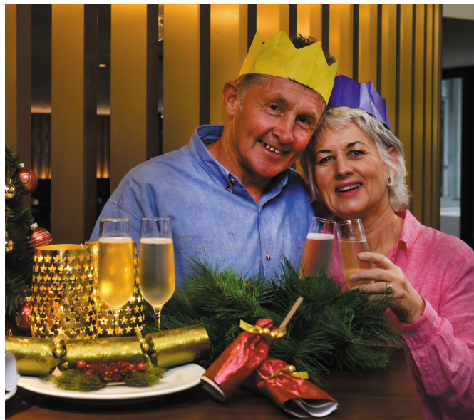
On Christmas Day, board the vintage steamship TSS Earnslaw and cruise across Lake Wakatipu to Walter Peak Station. Enjoy a gourmet Christmas lunch and the best of NZ's high-country cuisine in the Colonel's Homestead.