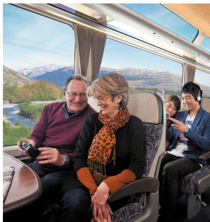
Tour Highlight: The TranzAlpine Rail Journey.