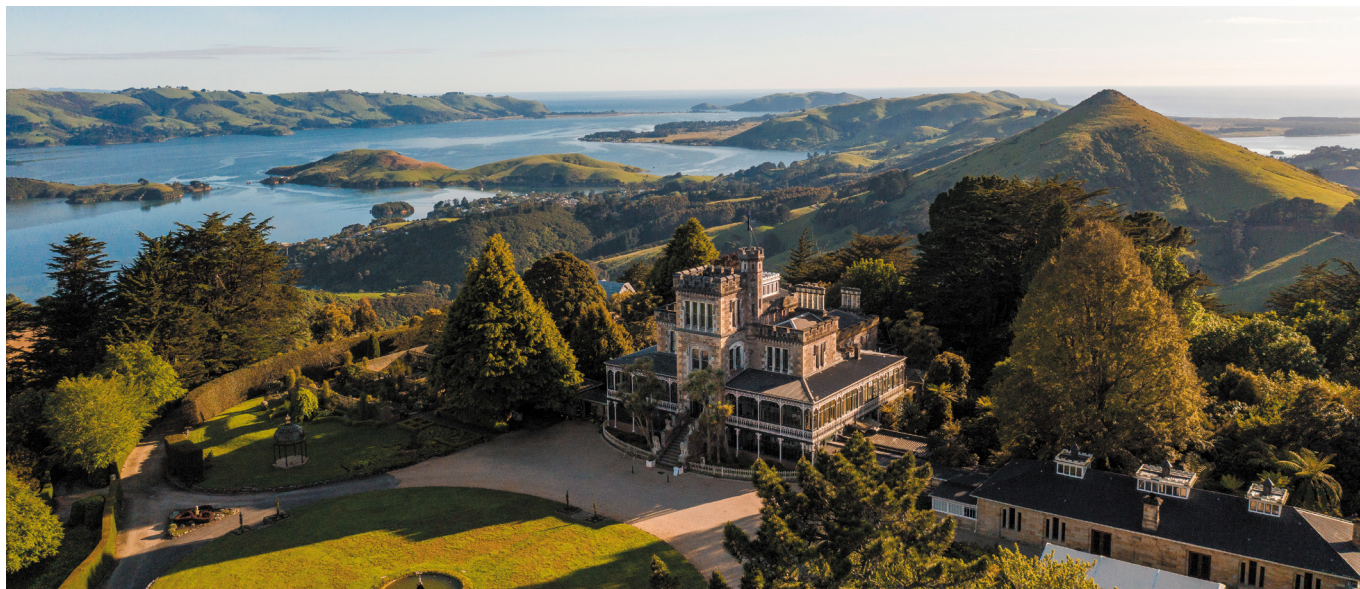
On Christmas day visit Larnach Castle for a guided tour followed by a delicious Christmas Dinner in the grand ballroom.