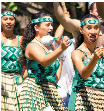
Feel the spirit of the Māori culture and traditions.

Tour includes transfers in New Zealand, Business Class 20 seat coach travel, 4.5 star accommodation, most meals, sightseeing, attractions and a range of VIP extras.