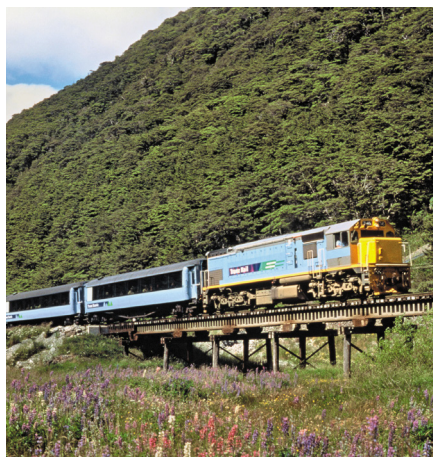
Tour Highlight: The TransAlpine Rail Journey.