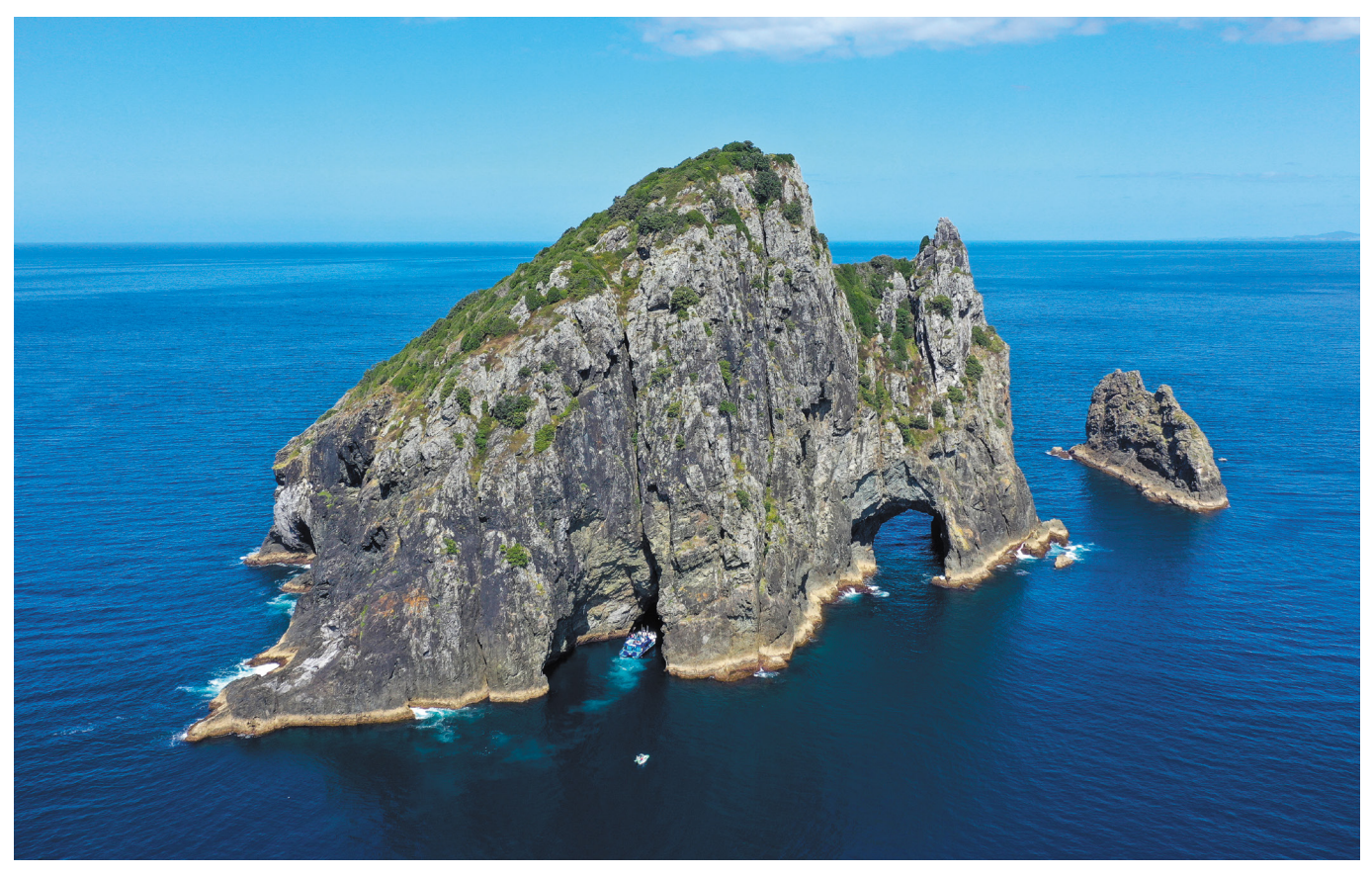
Above: Cruise through the beautiful Bay of Islands to Piercy Island, or as it's popularly known, the Hole in the Rock. Below: Experience an entertaining Māori Hāngi and Concert at the geothermal wonderland of Te Puia.