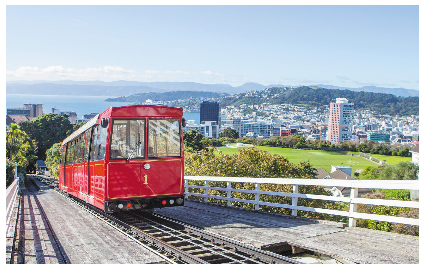
Ride the Wellington Cable Car for stunning views of New Zealand's capital city.