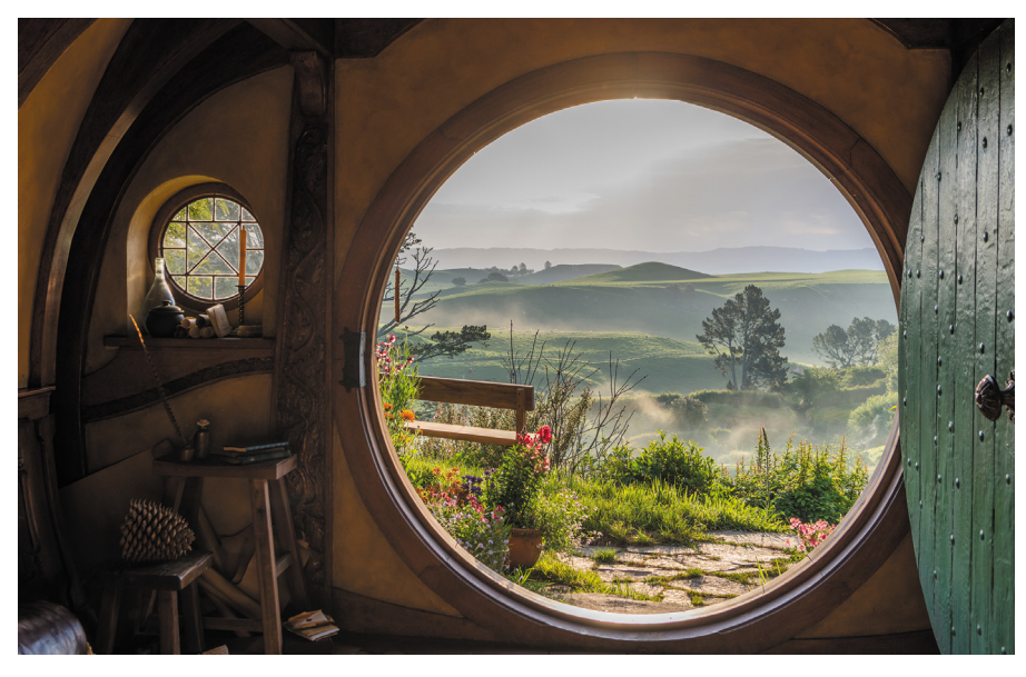
Experience the real Middle-earth on a tour of the Hobbiton Movie Set.