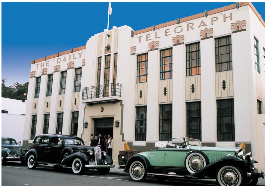
Enjoy an overnight stop in Napier, known as 'The Art Deco Capital'.