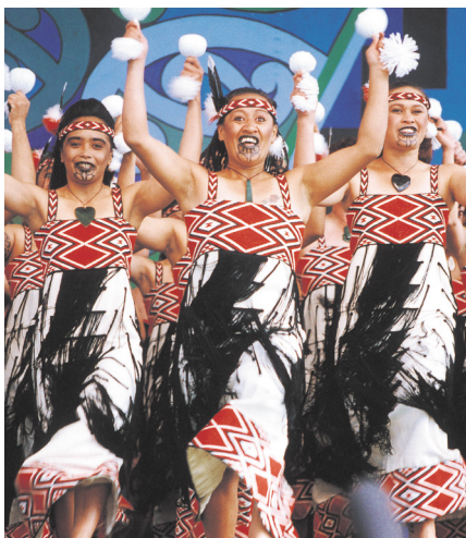
Feel the spirit of the Māori culture and traditions.