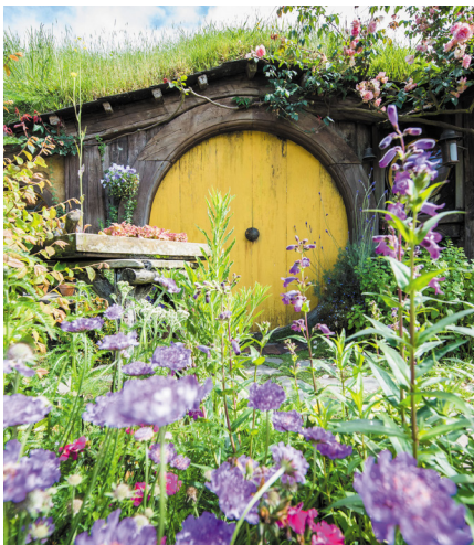
Tour Highlight: Hobbiton™ Movie Set Tour and Lunch.