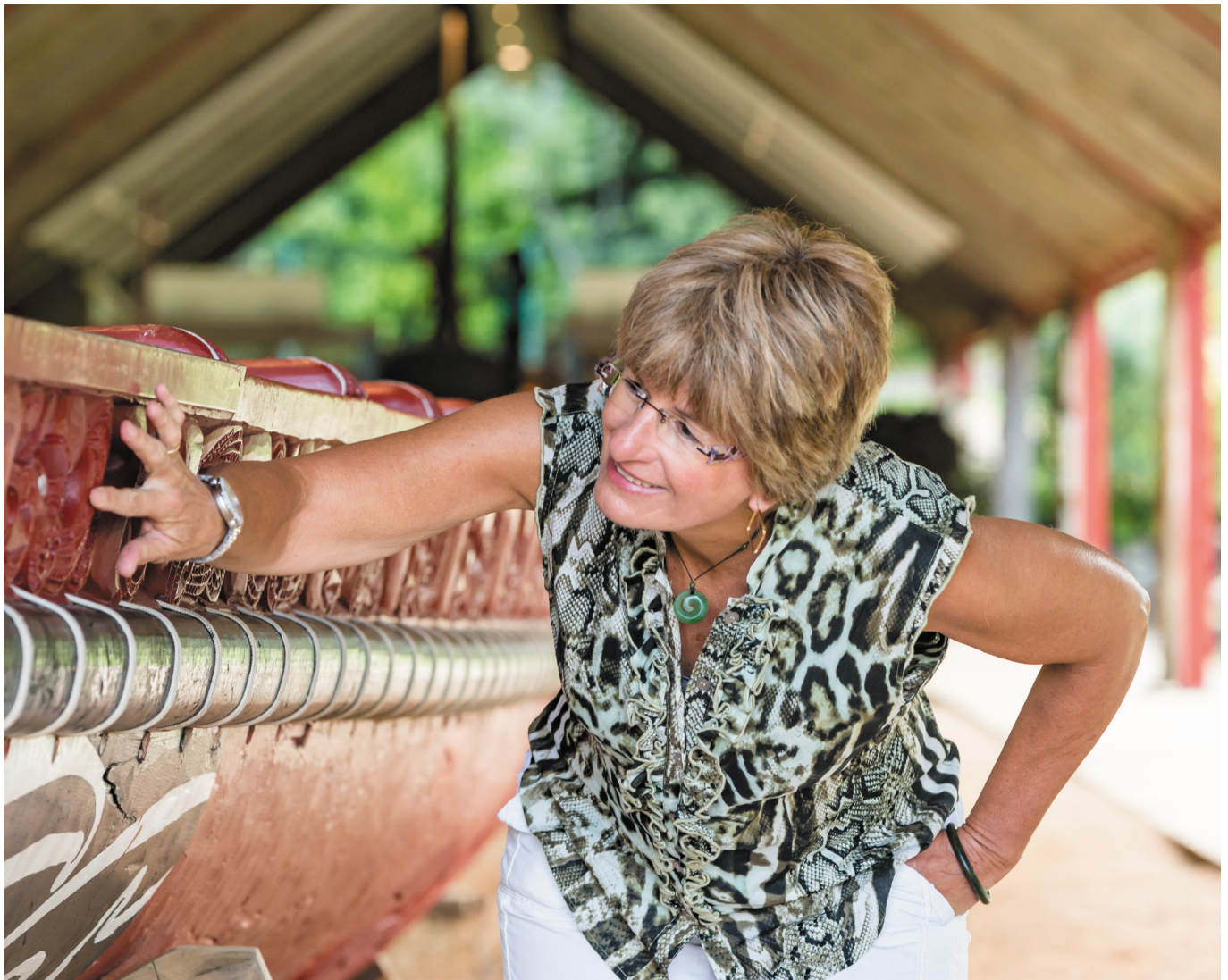
Waitangi Treaty Grounds, New Zealand's most important historic site.