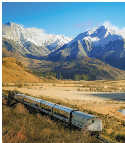
Tour Highlight: The TranzAlpine Rail Journey.